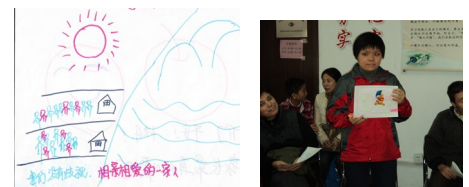
Above: "No discrimination. We are a loving family" (mother of teenager with autism)

adults with disabilities. Here we share some of their work, and their explanations.