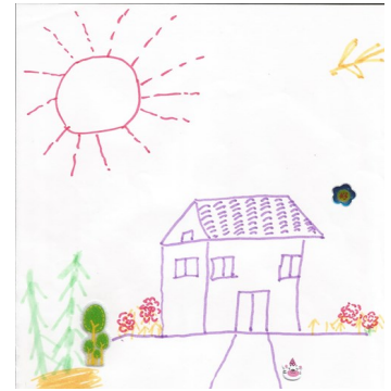
A warm family: Support group participant drawing (see p. 2)

In your annual giving at the end of the year, please consider supporting our work, so that more families of individuals with disabilities can receive support and education that they urgently need. (Donate online at www.thefiveproject.org or send a donation to 33 Fitch Terrace, Randolph, MA 02368)