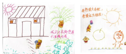
Above: "We all want a warm family" (chicks represent support group members) (mother of a young woman with intellectual disability); "We love nature, we love friends from afar" (by mother of young woman with psychological disability)

the families look forward eagerly to the monthly activity. This month, the families used drawing to express what they value most about the group. Everyone participated, including facilitators, parents, and young